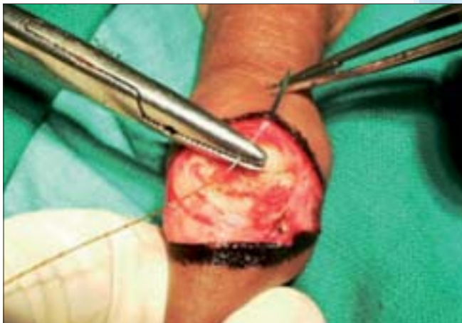
Figure 9: Closure of both layers