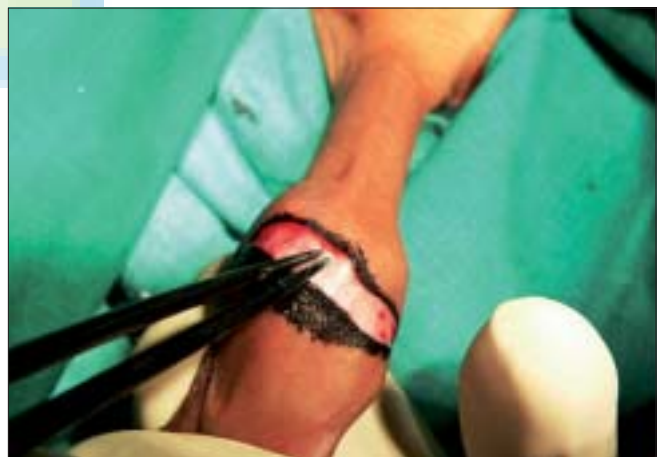
Figure 6: Coagulation of dorsal vein

with 5-0 chromic catgut and the incision was completed by taking care of the frenular artery with a figure of "8" suture. In this technique, all the blood vessels were coagulated before cutting the inner prepuceal layer so the blood loss was minimal [Figures 9-12].