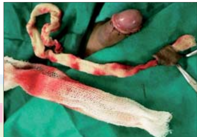
Figure 11: Cuff of excised prepuce and blood loss