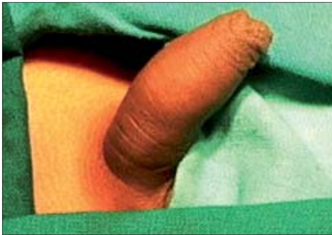
Figure 1: Preoperative photo