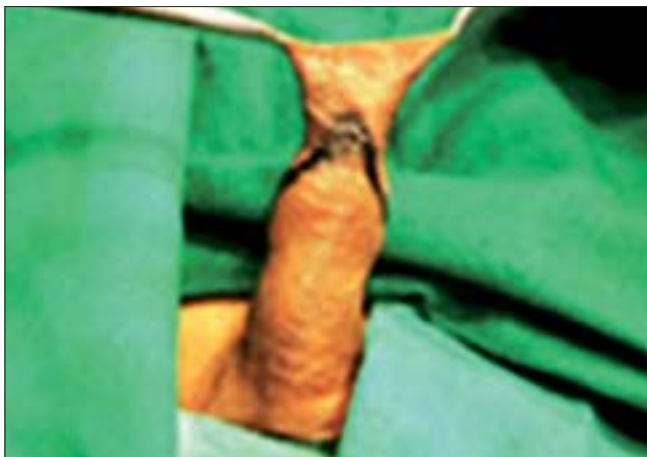
Figure 3: Ventral marking