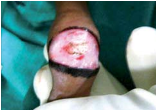
Figure 7: Cut both layers of prepuce