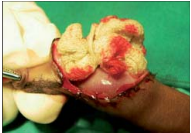
Figure 10: Closure complete