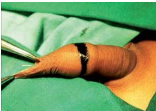
Figure 2: Coronal marking