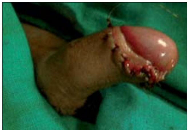
Figure 12: Final closure