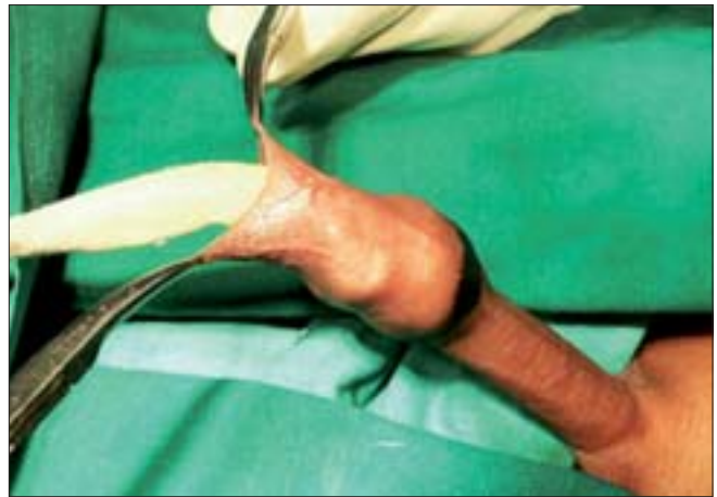
Figure 4: Packing gauge